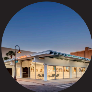
McCulloch Pavilion 265 S Orange Avenue

Visit the McCulloch Pavilion for information, many tour departures, and the MOD Shop!